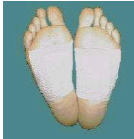
BEFORE AND AFTER USE